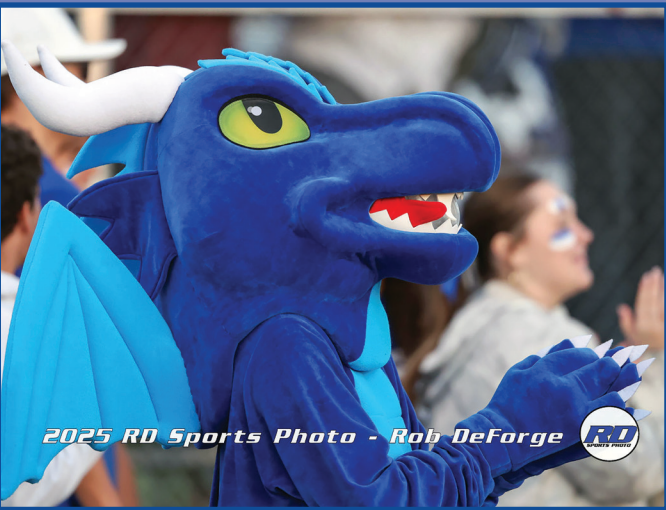
2025 RD Sports Photo - Rob DeForge