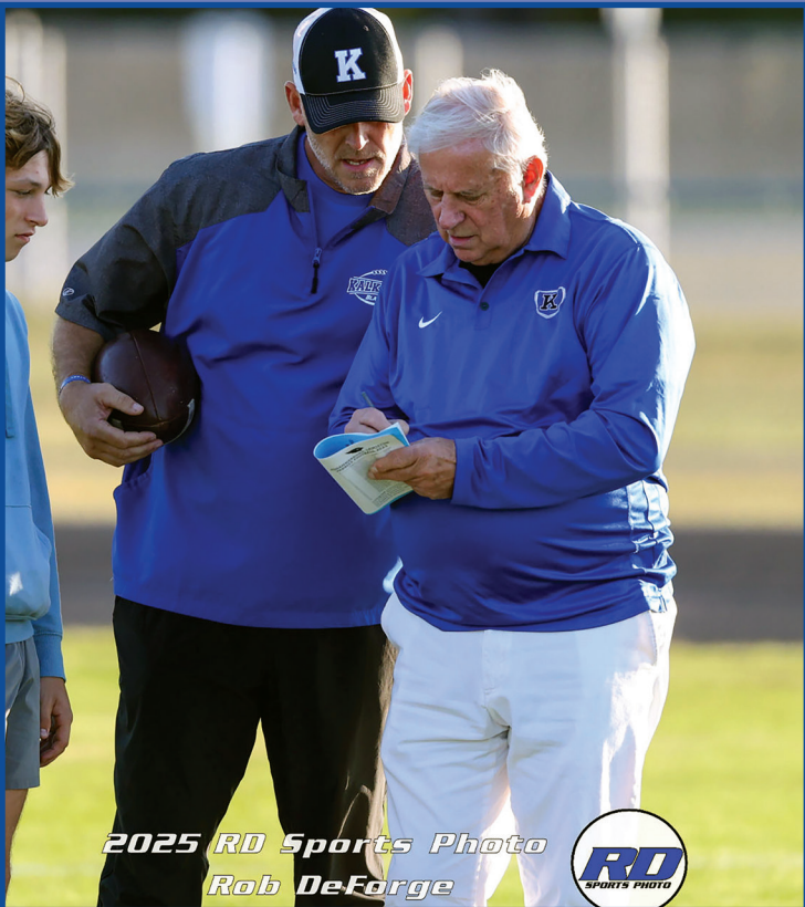
2025 RD Sports Photo Rob DeForge