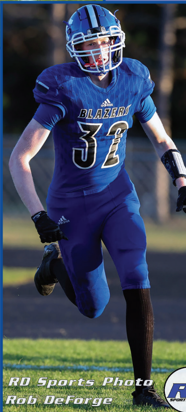
RD Sports Photo Rob DeForge