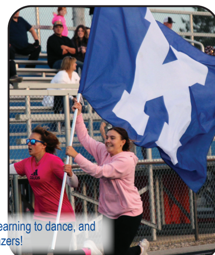
From Left — The KHS Band is making noise, the Spanish class is learning to dance, and the high school student section has SPIRIT! Go Blazers!