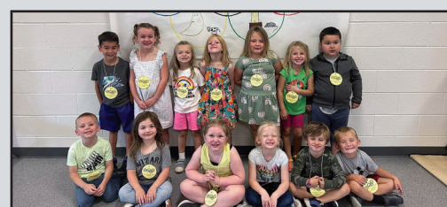
The different events at BSE: Scavenger Hunts, 2nd Grade Field Trip to Hartwick Pines, Kindergarten Nursery Rhyme Olympics, Good Manners Bingo Winners. The students are having a great time every single day!